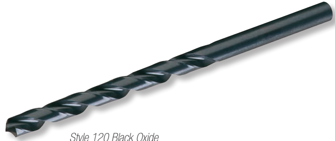
Style 120 Black Oxide